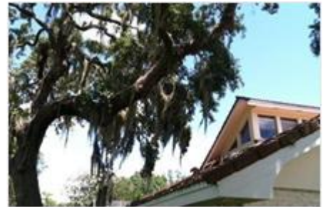
Tree Branches Hanging Over Roof