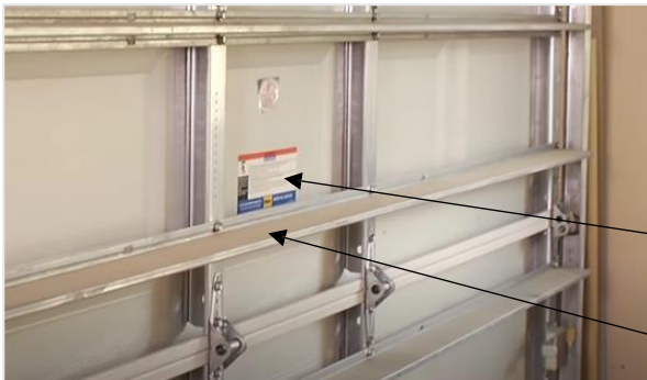
Sticker Identifying Thickness and Impact Resistance