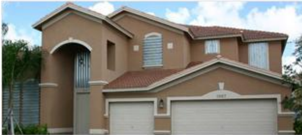
Aluminum Panel Shutters