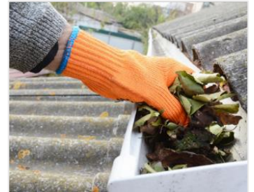
Debris in Gutter