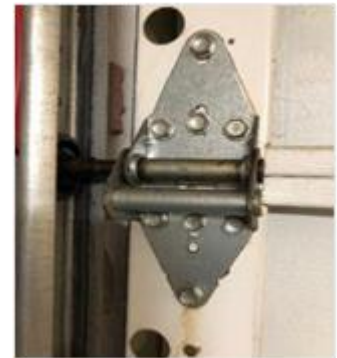
Track and Roller